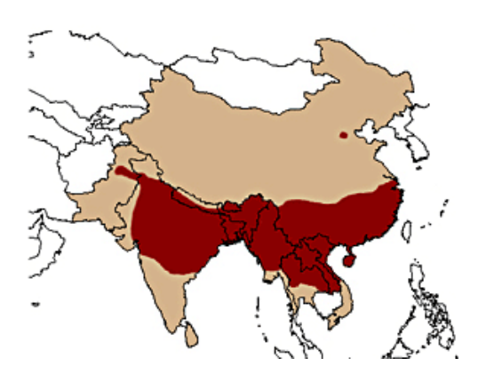
Fig. 1 World Macaca mulatta distribution. (From Cawthon), 2005.