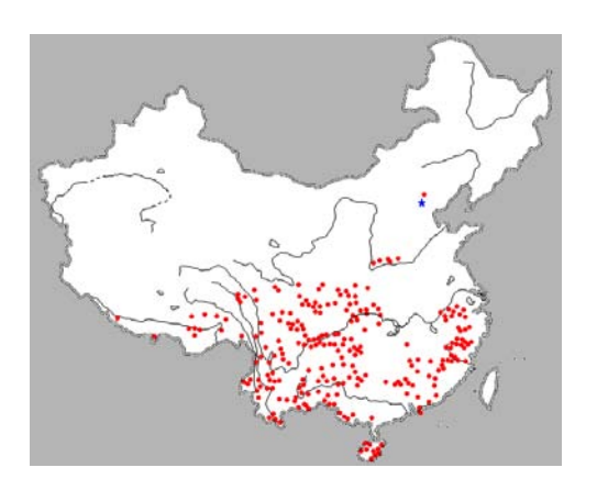
Fig. 2 Macaca mulatta distribution in China. (From Zhang, 1997)

There use to be an isolated Macaca mulatta population located at the northern edge of the distribution range of M. mulatta near Beijing in China (Fig. 2). The Macaca mulatta there were once classified as a independent species, Macaca tcheliensis , but most of researchers consider the population of rhesus monkey as a subspecies of Macaca mulatta . Quan et al. (1993) questioned whether the Macaca mulatta was native inhabitats to the place, or it might be introduced to that place by people.